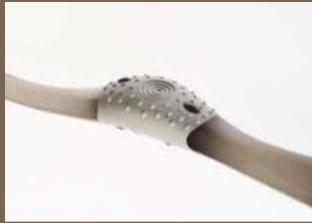
elastic, pressure-absorbing handle centre