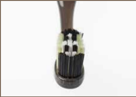
short head for better accessibility of the back teeth