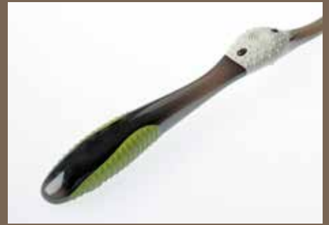
area for individual embossing at the end of the handle