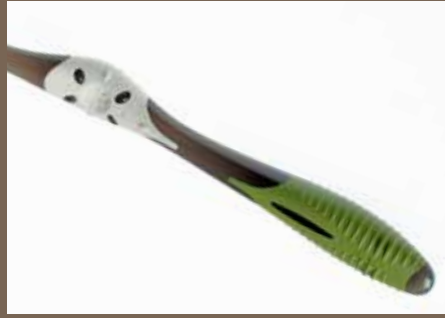
non-slip handle with nubbled TPE surfaces on both sides