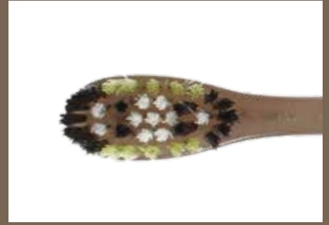
optimised bristle mix with gentle round end