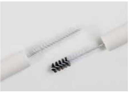
high quality trim materials