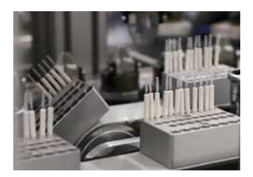
manufactured in highest quality thanks to most modern technology