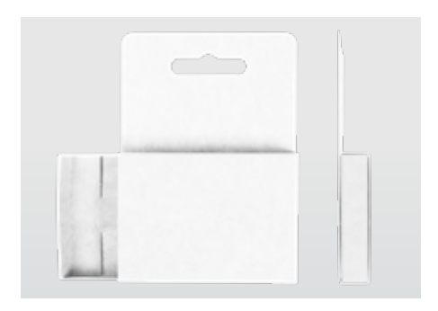
practical sliding box as a reusable storage option