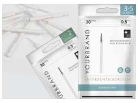
recyclable bag made of uncoated fresh fibre paper, with number of pieces of your choice