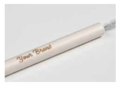
handle with individual logo laser engraving for your own label